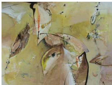
Milkweed Song: acrylic and ink on rice paper, 18-3/4x25-1/4