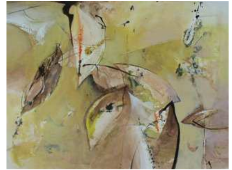
Milkweed Song: acrylic and ink on rice paper, 18-3/4x25-1/4